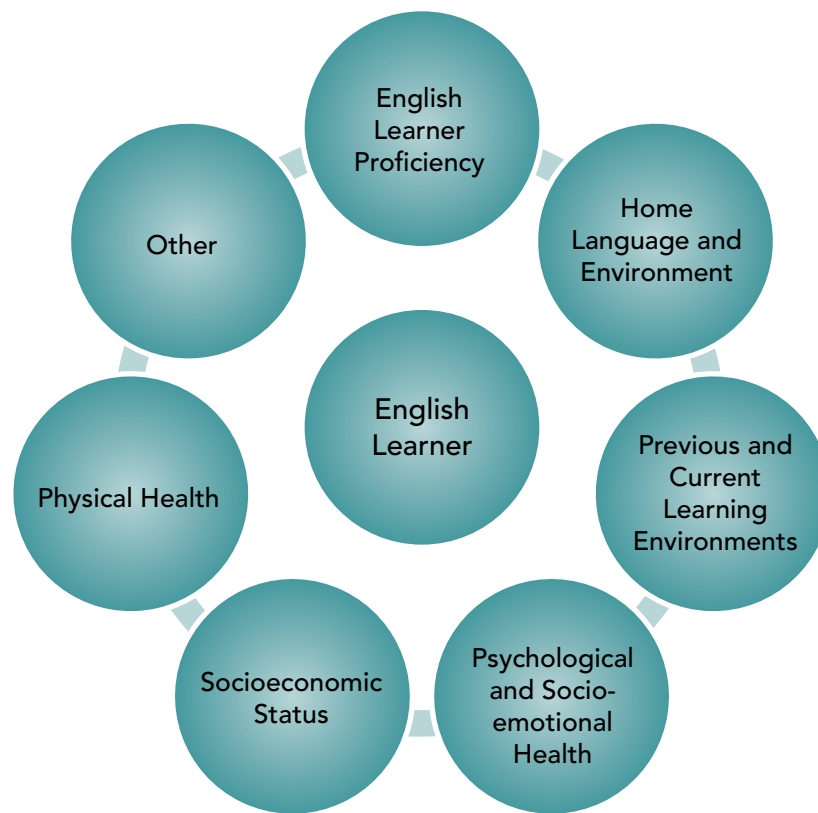
Figure 2. Sociocultural/sociolinguistic factors that might impact EL performance

In addition to ruling out lack of appropriate instruction as the determining factor for students' difficulties, federal law mandates that educators also eliminate limited English proficiency and other environmental factors as the root cause for students' academic struggles (IDEA, 2004). Distinguishing between disabilities and sociocultural/sociolinguistic factors has been found to be challenging for practitioners (Case & Taylor, 2005; Chu & Flores, 2011; Klingner & Artiles, 2003). States might institute collaboration between researchers and practitioners to design procedures for helping educators separate these factors from the presence of disabilities.